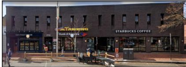
256 Elm Street

The HPC need to make determinations of whether the structure is to be preferably preserved and adopt findings.