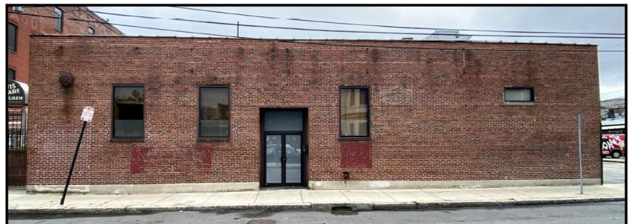
Right: Right Elevation